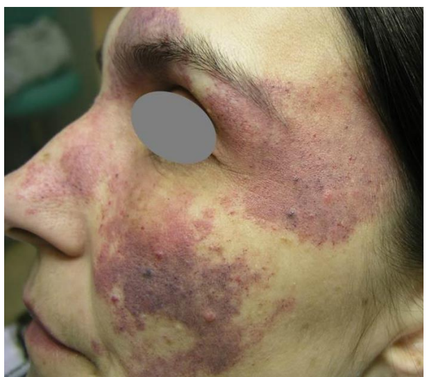
Fig. 1: Patient with red to dark purple port-wine stain on left side of the face before the laser therapy.

On her initial presentation, the port wine stain was red to dark purple and was distributed in the area of the first and second branch of the trigeminal nerve on the left side of the face (Fig.1). The patient claimed to have no known allergies or other diseases.