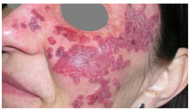
Fig 2: The development of redness and moderate oedema appeared immediately after the treatment and gradually disappeared.

The treatment was tolerated well by the patient. She reported a slight burning sensation for 30 minutes after the treatment and moderate oedema of the face for the next 2 to 3 days. Redness of the treated area developed immediately after the treatment and subsided gradually in the following 2-3 weeks, especially after 1 one week, when the treated epidermis peeled off and only minor redness resided (Fig.2).